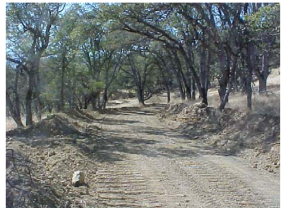
Existing road before and after widening