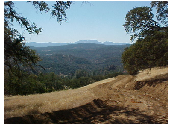
Bulldozer works on road extension (before and after)