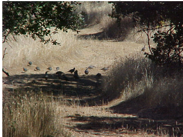
California Quail using the road

In the last issue of On Board it was reported that deer, coyote, wild pigs, turkeys, mourning doves, California quail, rabbits and bear have been seen on the property. There have now been sightings of a mountain lion, bobcat, raccoon, and numerous hawks and other birds. With the construction of the new road a sort of wildlife highway has been created where many different species are using the road on a regular basis to transverse the property.