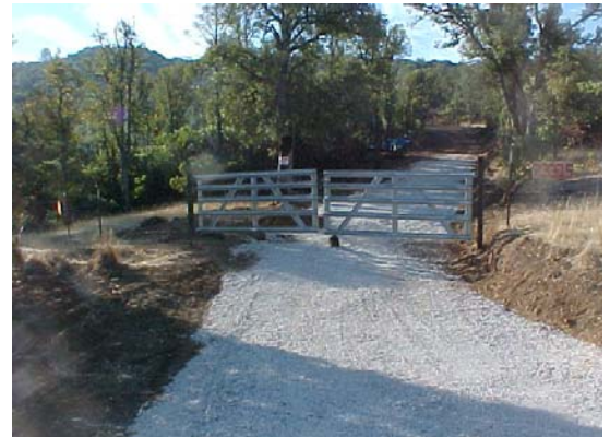
Completed New Access Road