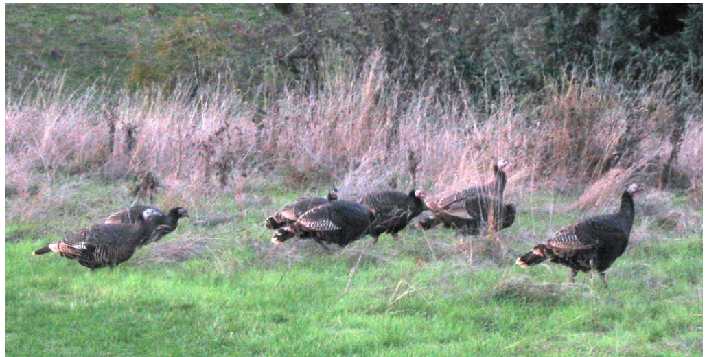
Happy Holidays from The AAARC Wild Turkeys – "Eat Ham"

The Board of Directors, Advisors and Staff want to take this opportunity to wish you a Happy Thanksgiving and a Happy Holiday season. Thank you to all of our 2005 supporters, especially those members of the Ground Breakers Club. It is through your financial and other contributions that we are able to continue to make the AAARC a reality. Have a safe and wonderful holiday.