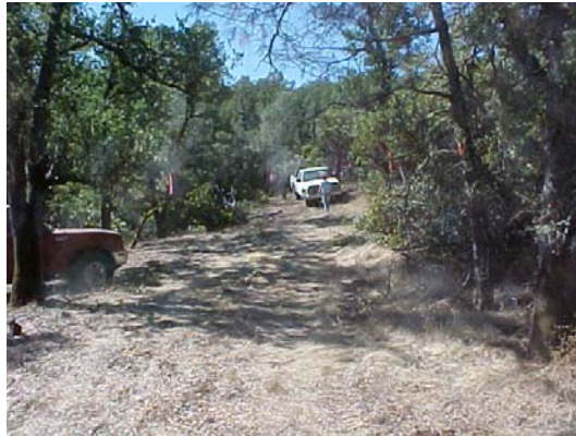
New Access Road Being Cleared

A new access road into the property was completed in October. Improvements, such as widening, culverts, and elimination of steep grades were also made along the entire length of the existing AAARC road. The new access road shortens the distance into the property and creates private access. Although gravel surfacing will need to be done in the future the road is vastly improved over what existed before. The following photos depict some of the road improvements.