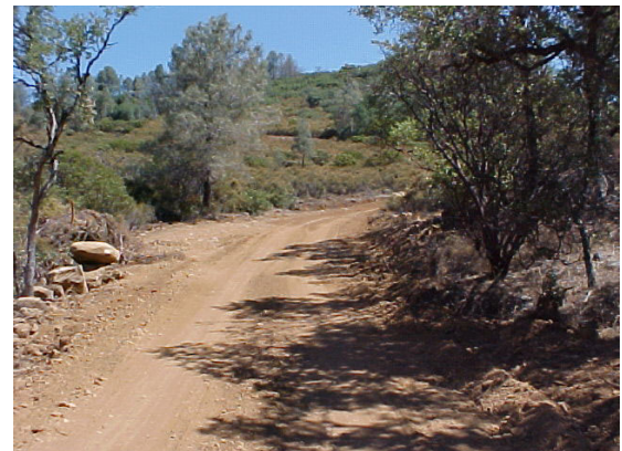
Drainage Improved and Road Widened Along the Entire Length

If you know of others who would like to receive a copy of On Board or you do not want to receive future copies of this newsletter please send us an email at newsletter@aaarc.org and let us know.