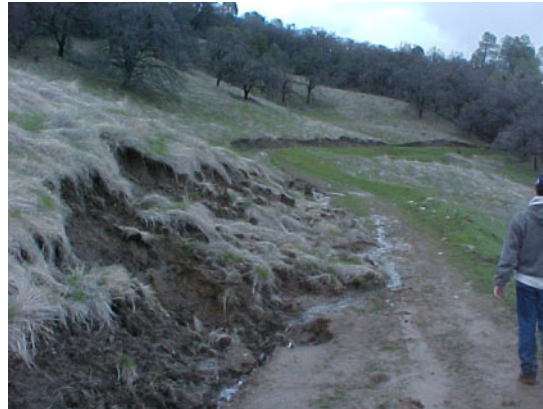
Slumping Along Road

After months of work the repairs to AAARC's road system have been completed. Damage from last winter's devastating storms included washouts, slumping, small land and rock slides, and deep rutting. The repair and improvement work cost close to $50,000 but has resulted in a vastly improved road. If you would like to donate to the repair fund please contact Mel Johnson. The following photos show a small amount of the extensive work that was done.