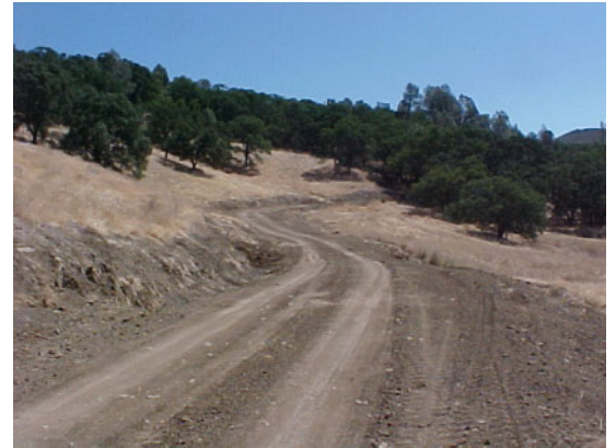
Slides removed and Road Widened