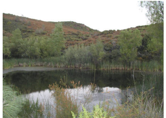
Location of the Future Water Pavilion and Spiritual Path

Recently the Board of Directors spent a day out on the property with our advisor architect Paul Gilger, to begin the site planning process. As they explored possible building sites for the lodge, campground and small satellite lodges, discussion also ensued over where to place things such as meditation sites or pavilions for special events such as weddings. One exciting proposal advanced by Paul was to create an over the water pavilion on the edge of one of the ponds. It would serve as both a place for special events such as weddings but also as a meditation place. Additionally it was discussed and approved to create a path around the pond that contained shrines to the major religions of the world. The Board immediately saw this area as a destination spot for visitors to the Retreat Center.